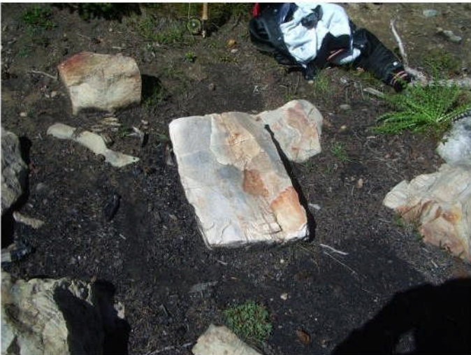
The 33 year old rock