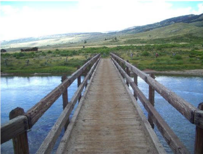
The bridge and head waters of the Green River