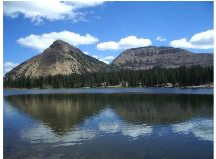
Square Top Mountain