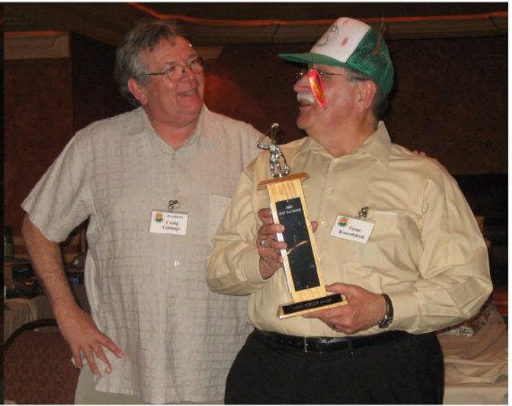
Sammy Schelp Award