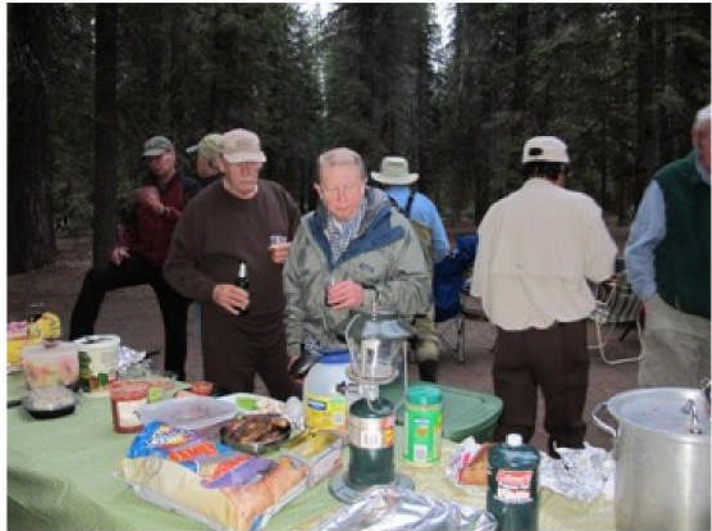
Everyone is waiting for the potluck dinner to get started